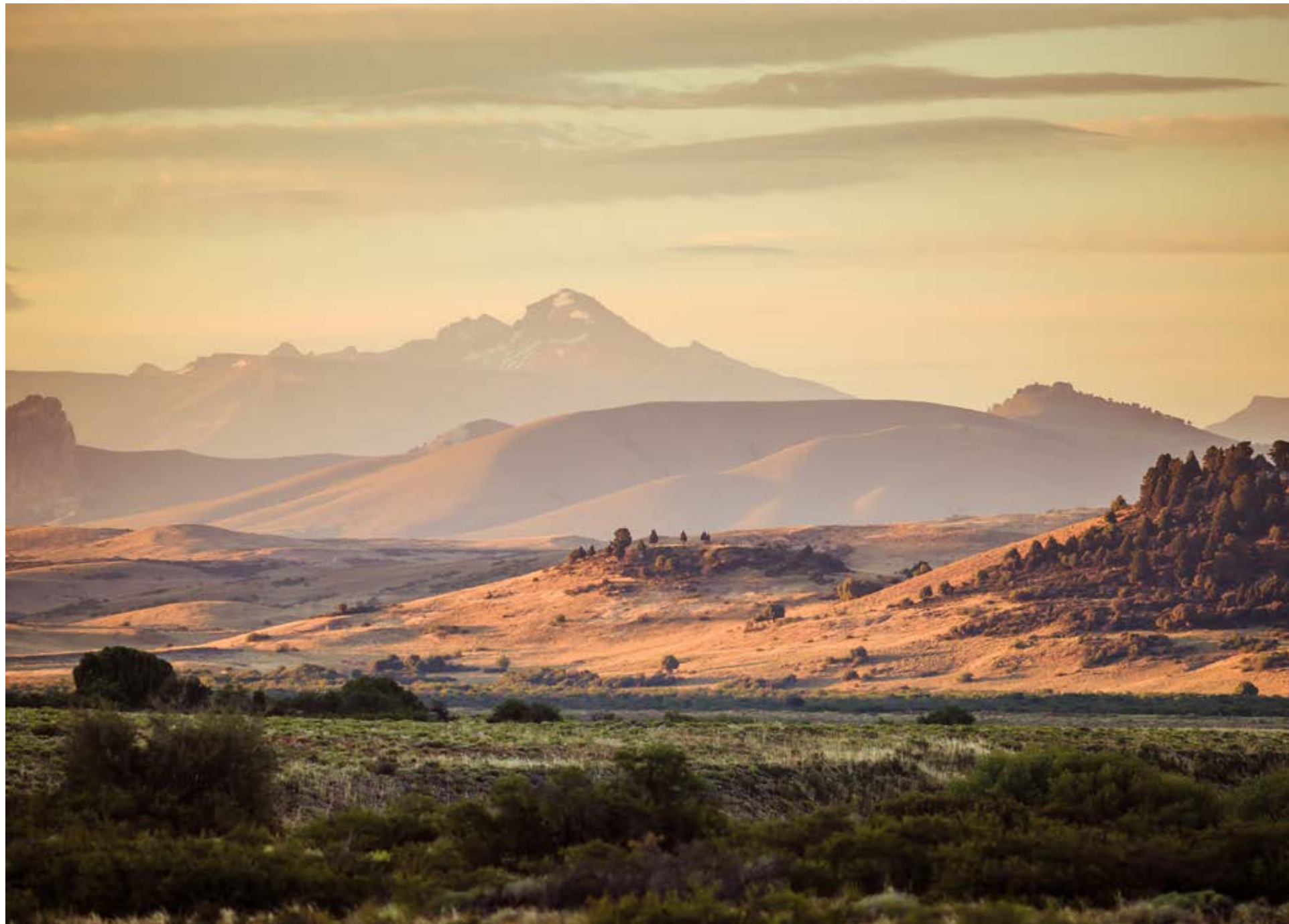
The landscape surrounding Chime Lodge: Chimehuín Valley, Junín de los Andes.