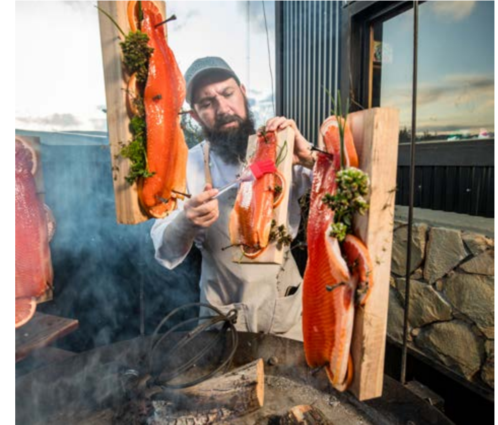
Wood roasted Patagonian trout hung over the fire.