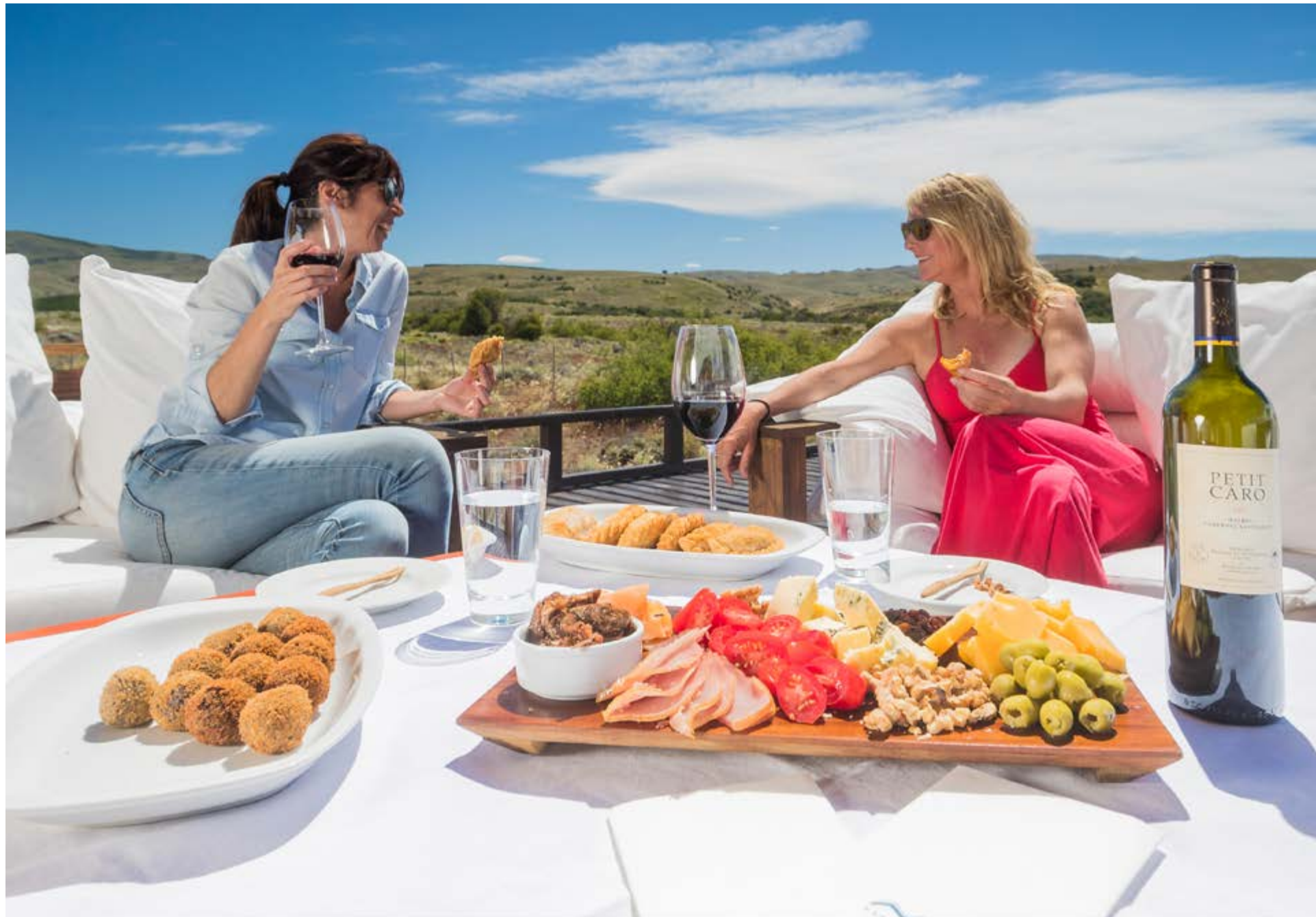
Enjoy a nice glass of wine and appetizers on the deck, with matchless views of the Chimehuín River and the surrounding landscape.