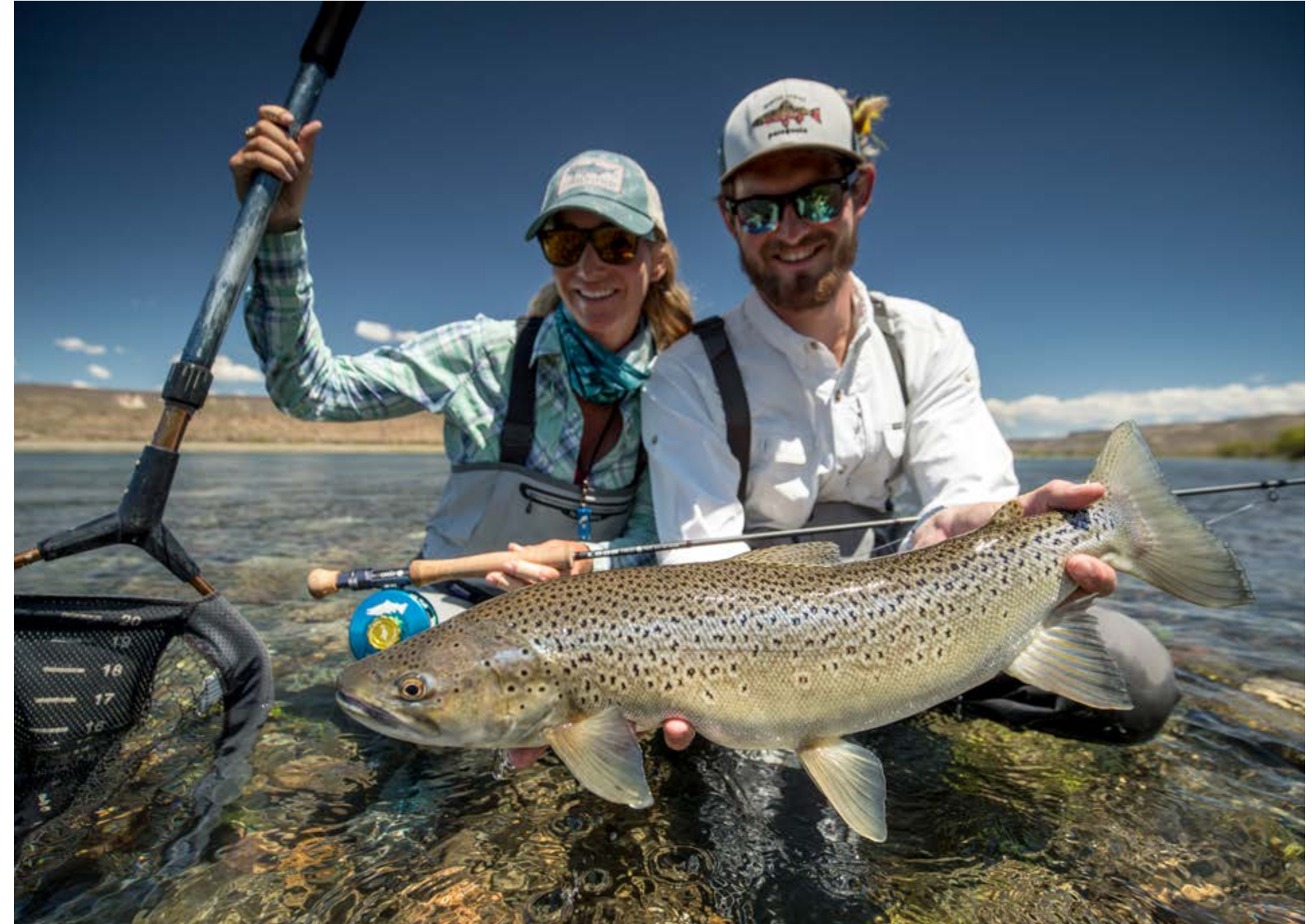
Chime Lodge boasts front-door access to the greatest diversity of trophy brown and rainbow trout waters.